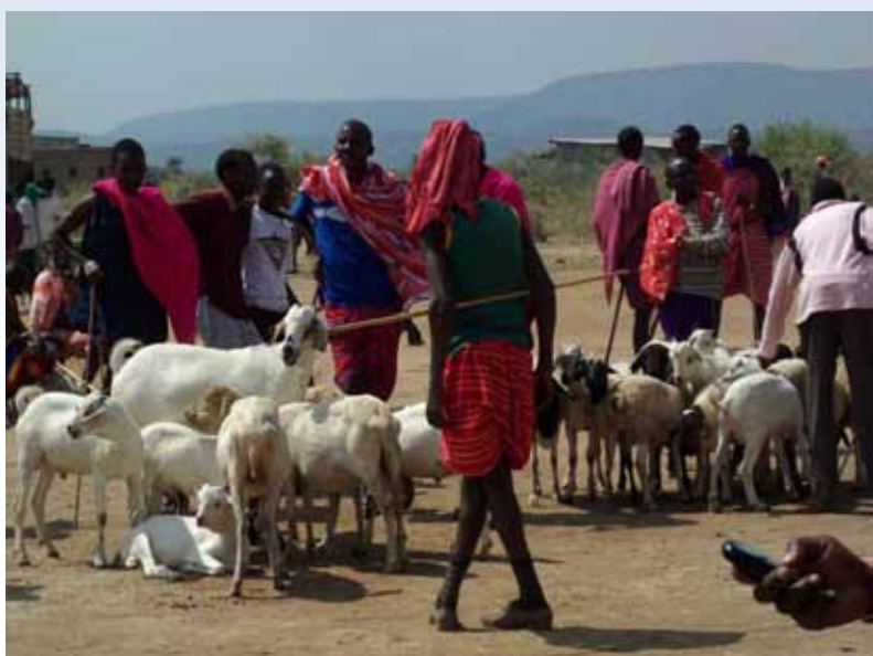
Pastoralist exchange livestock and their products to meet their needs