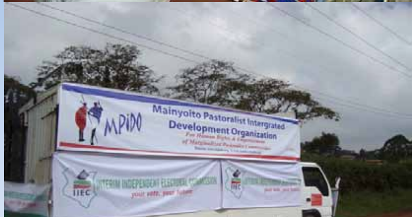
Civic Education: MPIDO used different communication medium like songs and road shows to reach its audience