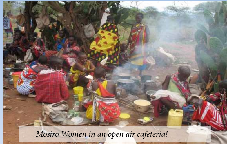
Mosiro Women in an open cafeteria!