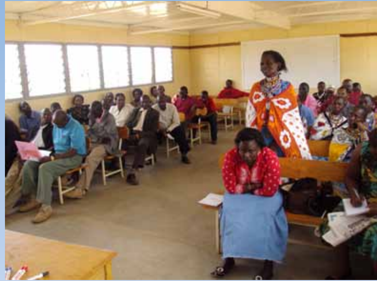
Stakeholders meeting during FGM Deliberation