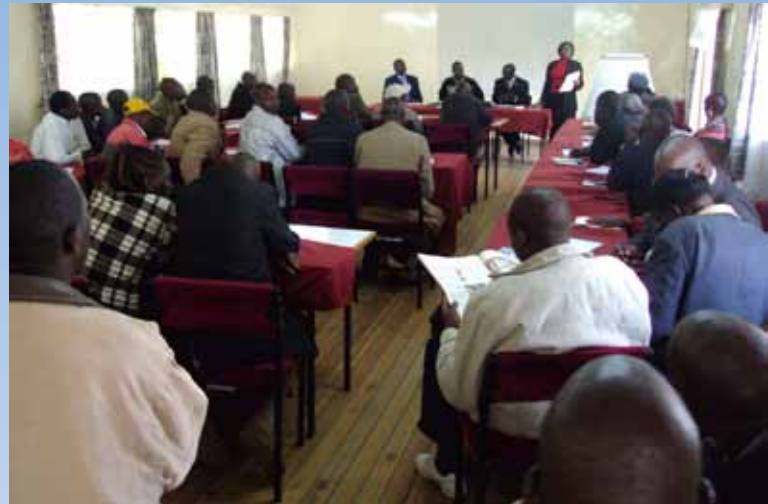
The registrar of group ranches answering questions from members of the group ranches committee