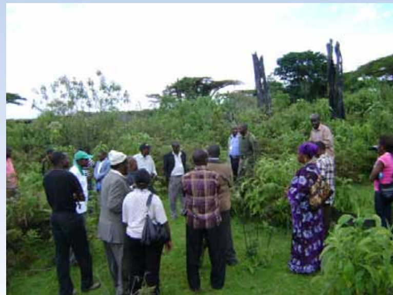
Above: Regional partners visit to the destroyed Mau Forest Left: Ilchamus indigenous women pray through dance for the rains