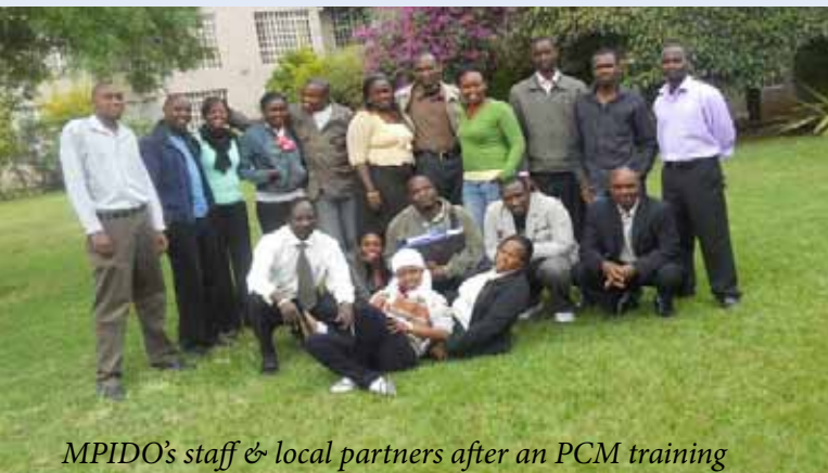
MPIDO's staff & local partners after an PCM training