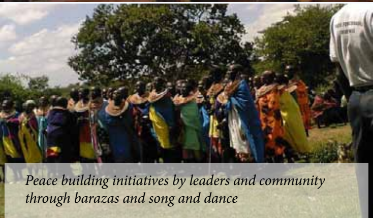
Peace building initiatives by leaders and community through barazas and song and dance

Since the inception of this program, MPIDO has been involved in various national processes including the constitution, National commission on boundary review and land policy review with concrete achievement recorded in the space secured by the Maa speakers in the process as well as representation of critical issues of land provided for in the current land policy.