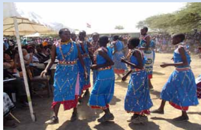
Girls perform during a prize-giving ceremony which seeks to boost retention in schools