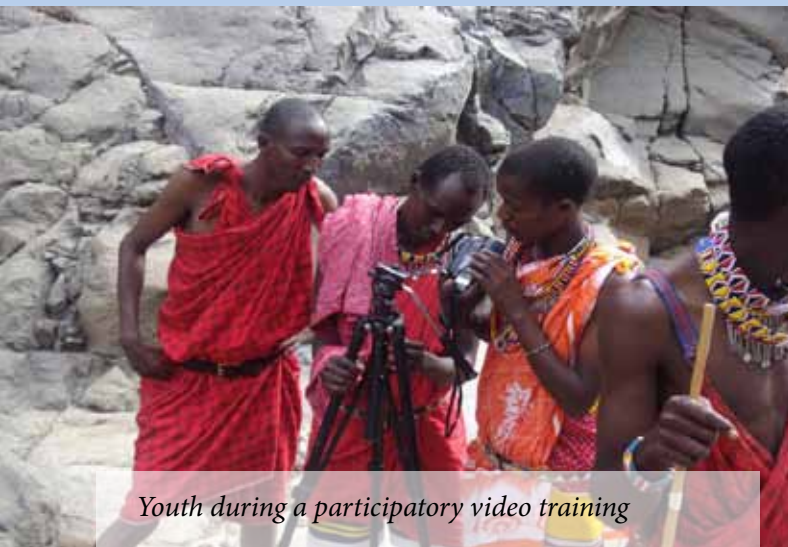
Youth during a participatory video training