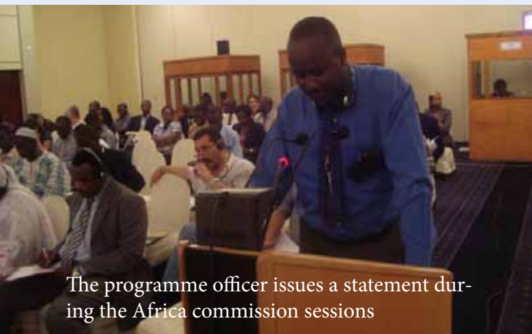
The programme officer issues a statement during the Africa commission sessions