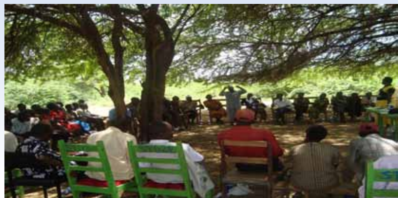
Landrights: Community meeting on land