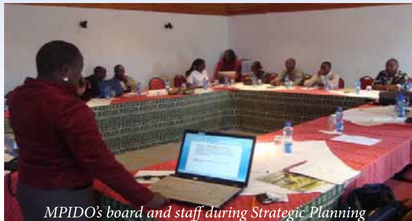
MPIDO's board and staff during Strategic Planning